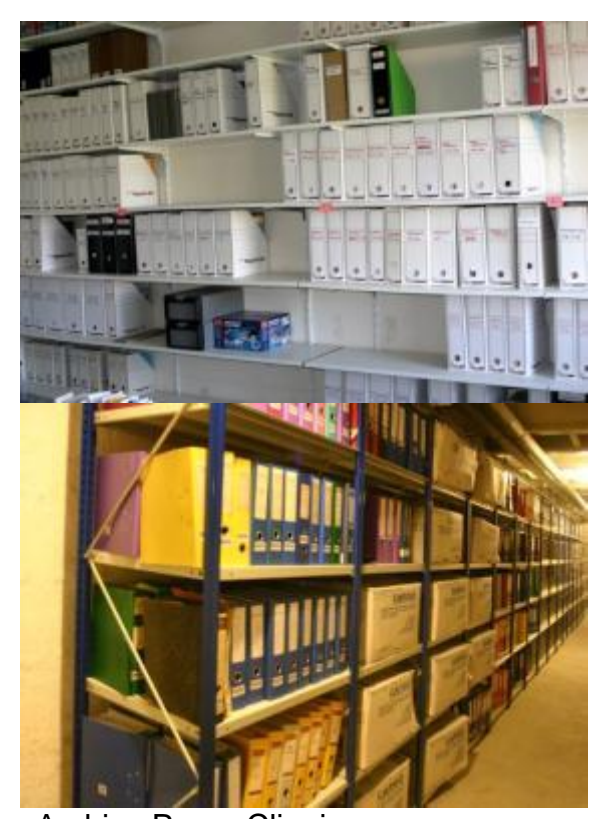
Archive Paper Clippings