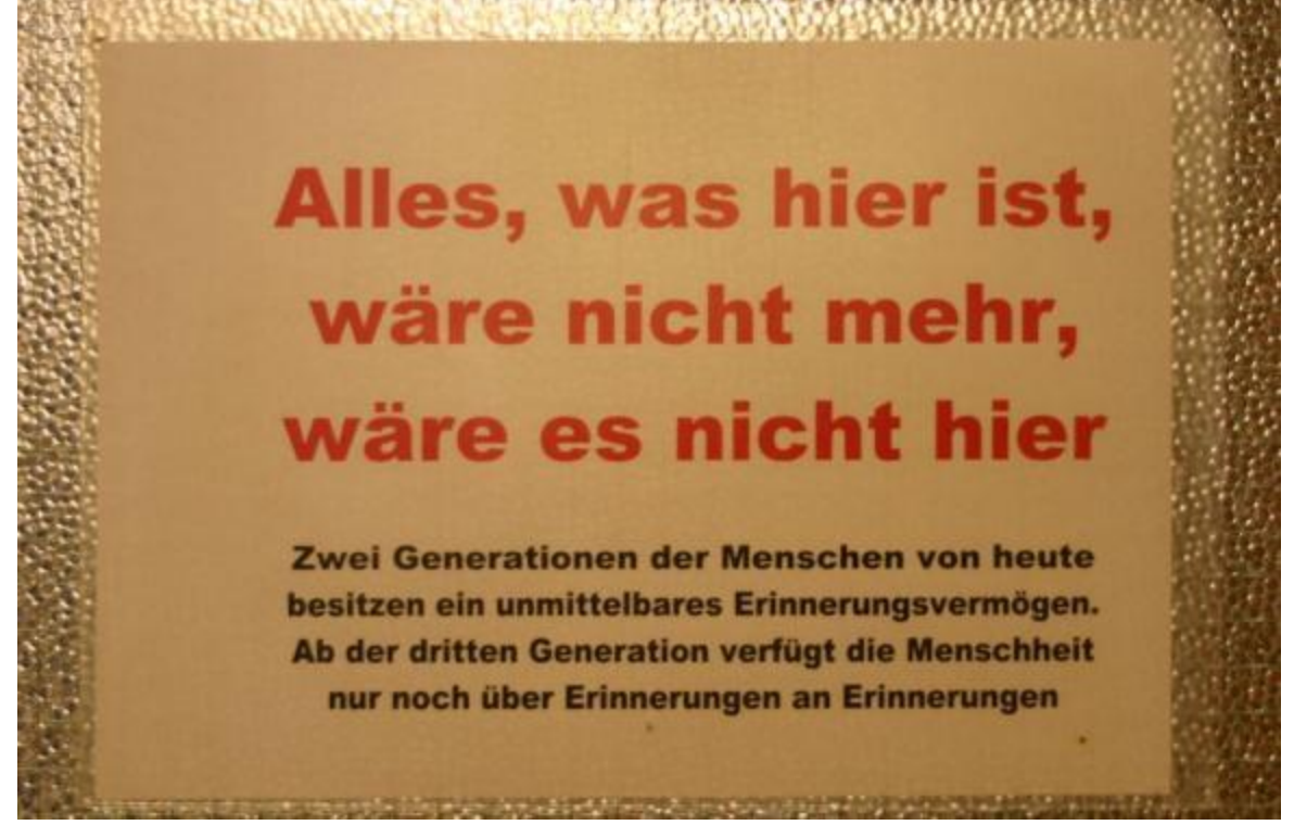
Everything that you find here would not be available had we not kept it. Two generations of people today share an immediate memory. From the third generation of mankind, we only have memories of memories