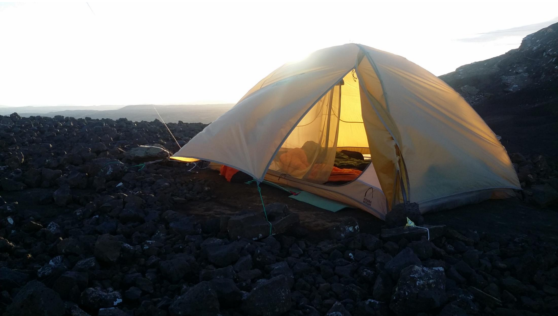
Sunrise at 6:08 seen through the tent, when forced out by first duty of the day.