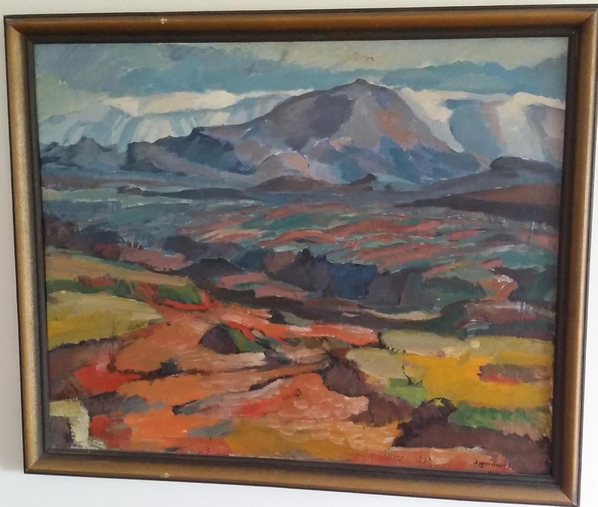
Helgafell on the wall of our living room (TF3GD and TF3DX) - by painter Ásgrímur Jónsson (1876 – 1958)