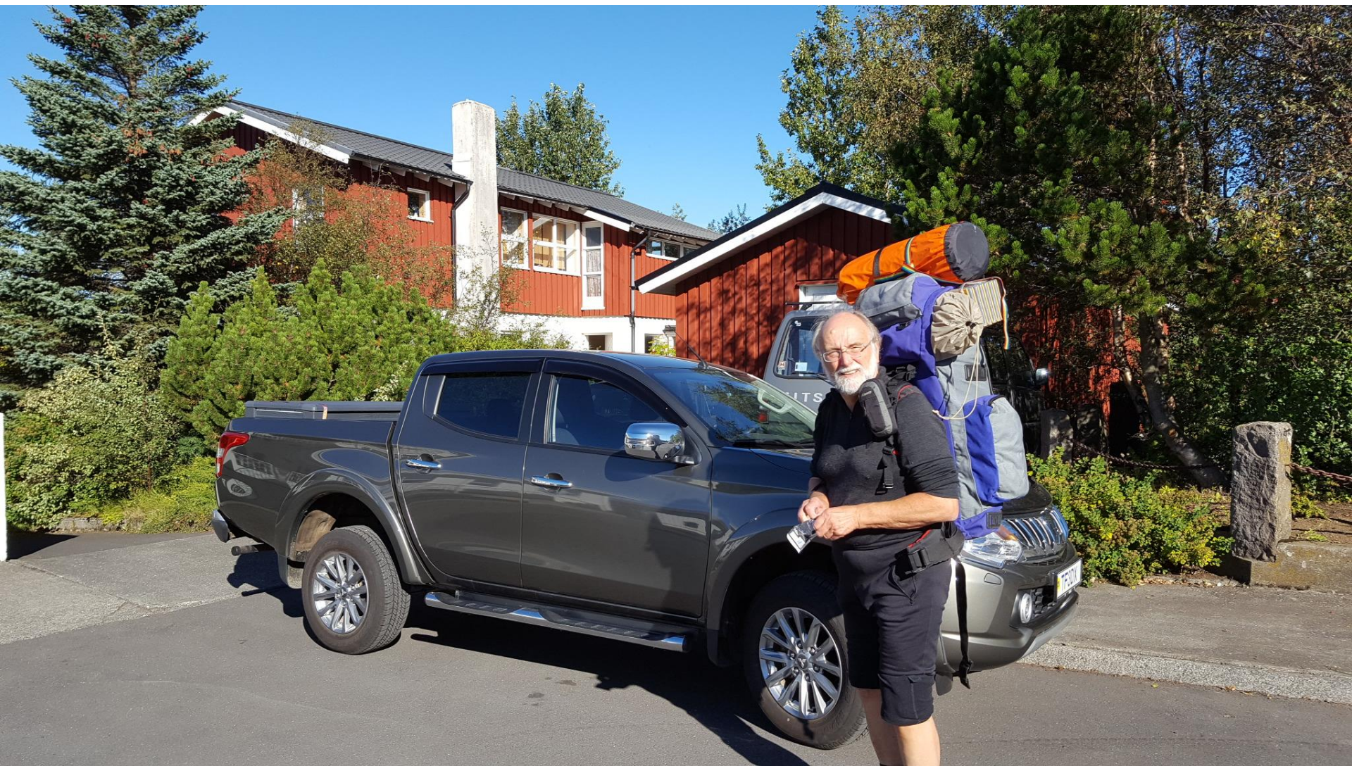
TF3DX setting out for Helgafell.