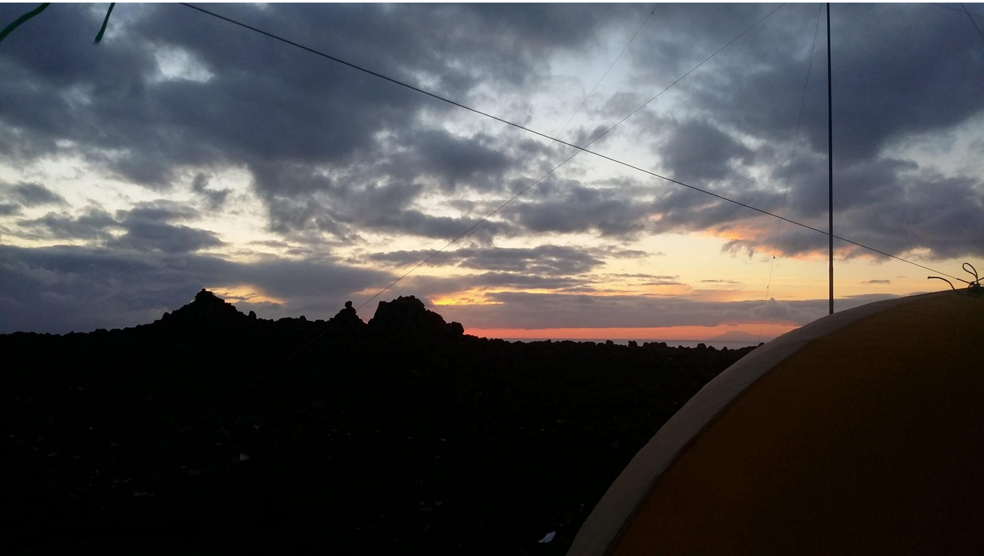
The late show. Bordering on the tent is the Glacier/volcano Snæfellsjökull, TF/SN-001. 1446 m high and 125 km away.