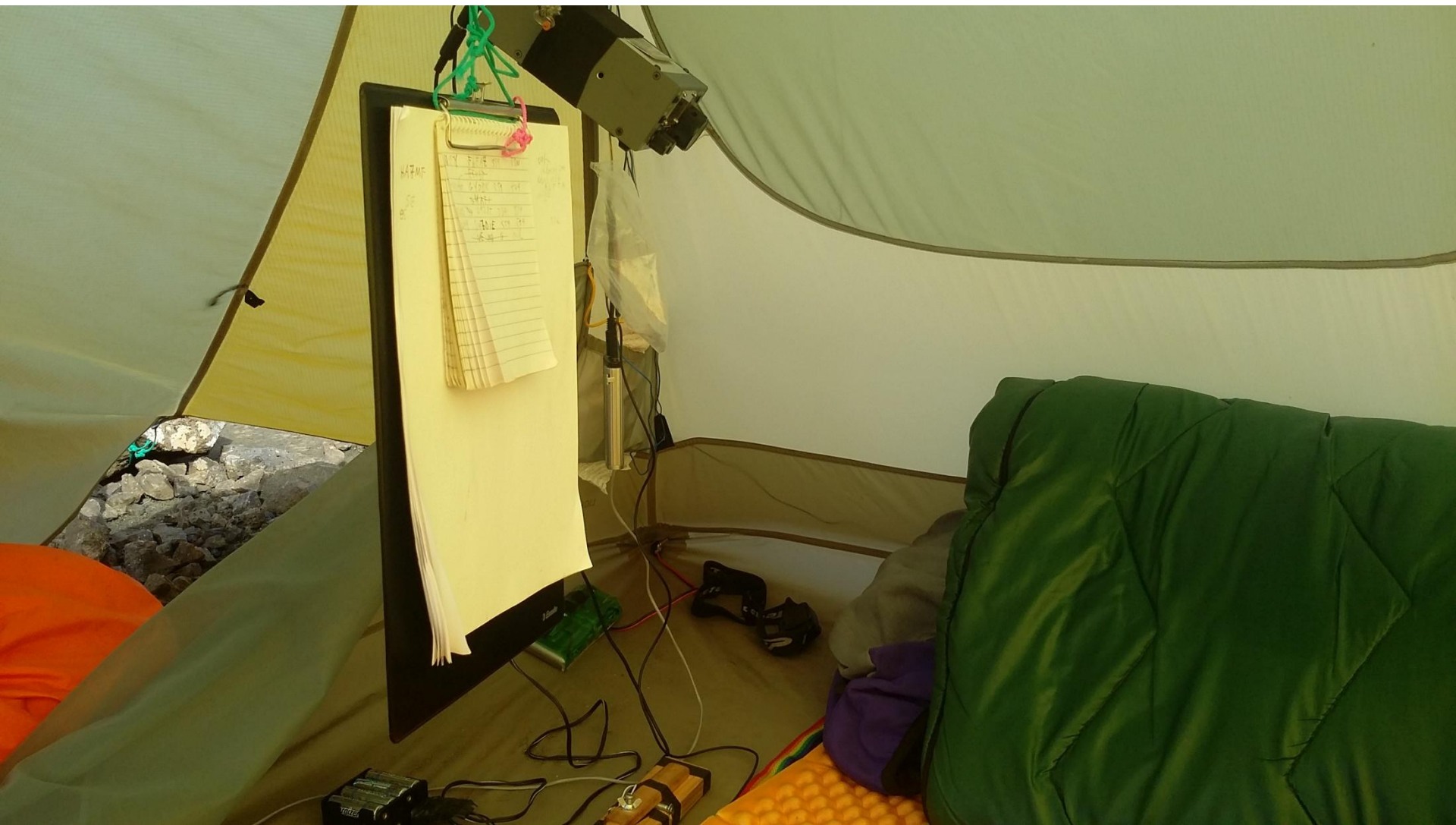
The shack for horizontal operator. Key usually resing on the chest - have had many a chat that way.